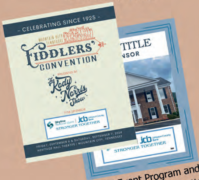
Virtual Event Program and Event Slideshow Presentation