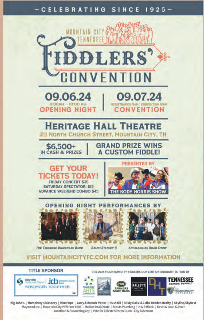
Posters, Flyers & Newspaper Ads